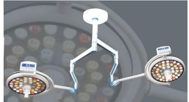
MODEL NO: MMD 48+48

With high light intensity and large spot size ,1200 mm. Depth of field provides good lighting without having to refocus when the surgical wound location changes. The light head can be positioned for away from the wound to ensure better laminar flow.