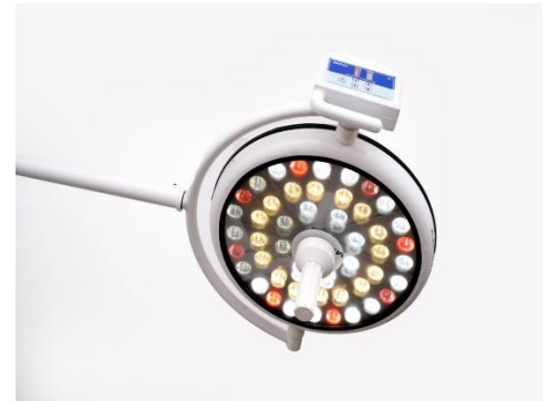
MODEL NO: MMD 48

With high light intensity and large spot size ,1200 mm. Depth of field provides good lighting without having to refocus when the surgical wound location changes. The light head can be positioned for away from the wound to ensure better laminar flow.