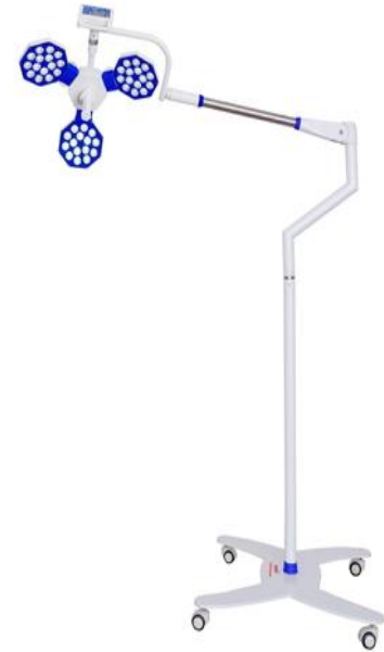
MODEL NO: MMD 3