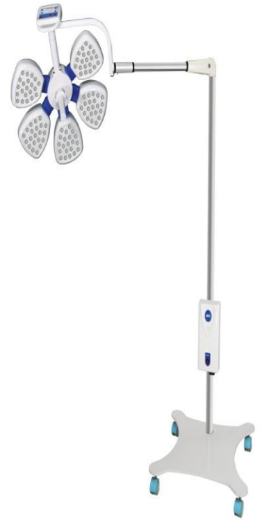
MODEL NO: MMD 5