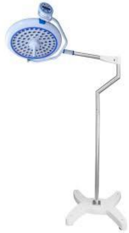
MODEL NO: MMD 48