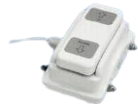
Foot Switch (Optional)