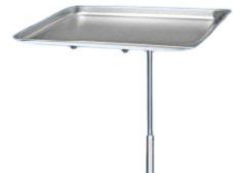
Instrument Tray (Optional)