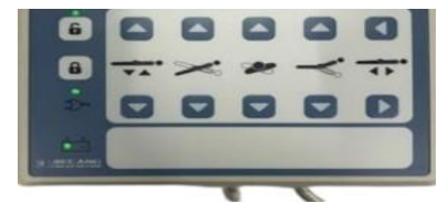
Nurse Panel Control