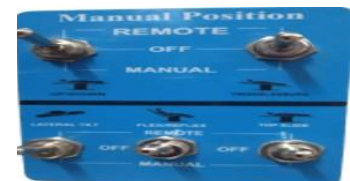
Manual over ride control